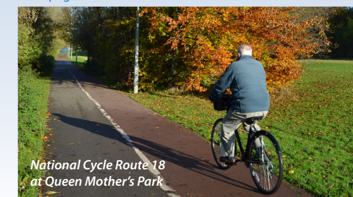
National Cycle Route 18 at Queen Mother's Park

For further information on cycle routes see contacts on back page.