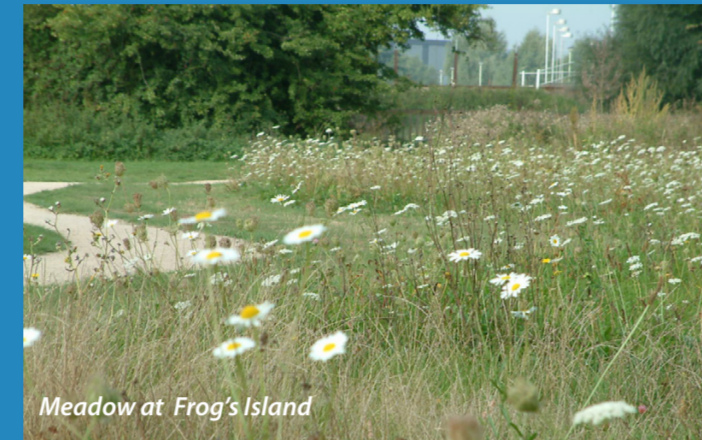
Meadow at Frog's Island

The rivers, riverbanks, trees, orchards, wetland, meadows, park areas, playing fields, ponds and hedges of the Green Corridor demand different kinds of management; management which balances wildlife conservation with maintaining good, safe access and space for people to enjoy.