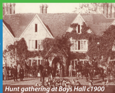
Hunt gathering at Boys Hall c1900

From the manors of Buxford in the west to Boys Hall Moat in the east, the Green Corridor is rich in heritage.